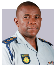
Lieutenant General NS Mkhwanazi Provincial Commissioner: KZN, Committee Member