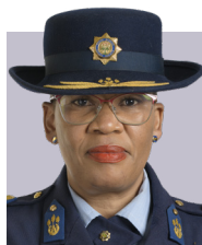
Lieutenant General TC Mosikili Deputy National Commissioner: Policing, Deputy Chairperson