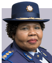
Lieutenant General MH Hadebe, Provincial Commissioner: Limpopo, Committee Member