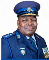
General SF Masemola (SOEG)

As I traverse the length and breadth of our country in service of the people of South Africa, I am continually inspired by the calibre of men and women who serve within the South African Police Service (SAPS). Across all ranks and environments, I encounter members who exemplify hard work, dedication, professionalism, and competence. While I am privileged to personally acknowledge some of these outstanding individuals, it is inevitable that many others, equally deserving, may go unrecognised in the course of daily engagements.