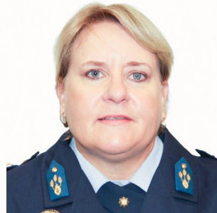
COLONEL AEM LOUW