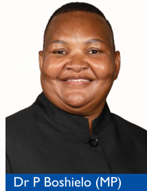
Dr P Boshelo (MP)

T here is no doubt that Policing has a profound impact on communities and plays a vital role in ensuring the safety and security of our nation. The assurance of safety and security is not merely a function of government; it is a foundational pillar upon which the stability and prosperity of our nation is built.