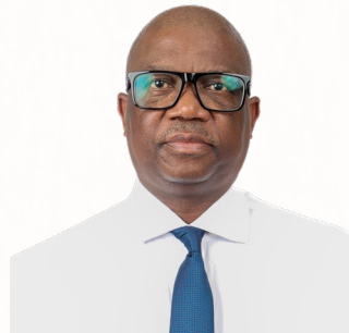
BRIGADIER WS KUNENE