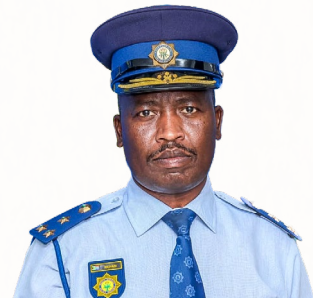
BRIGADIER HB MASHABA