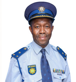
BRIGADIER IM MHLONGO