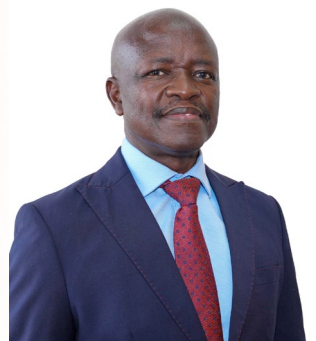
BRIGADIER DE NKOMO