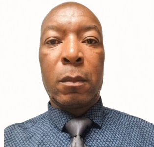
LT COLONEL KS MPHOLO PRIORITY CRIME SPECIALISED INVESTIGATION