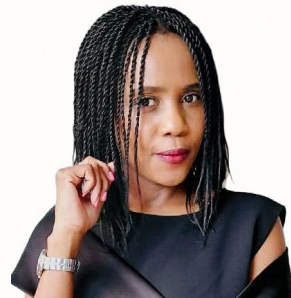
COLONEL PPN THELEDI