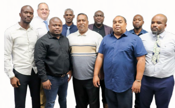
WO MI RAOOF PROVINCIAL DRUGS & FIREARM TEAM