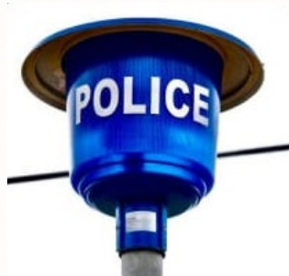
CAPTAIN TO NKHUNA OHRIGSTAD