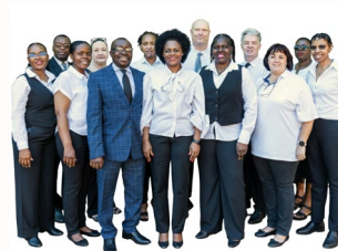
MAJ GENERAL A SITHOLE