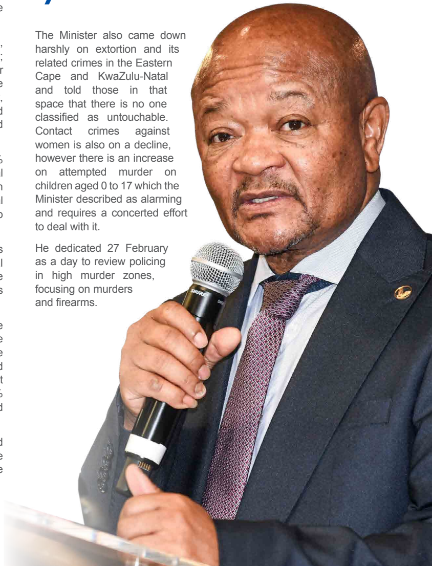
Minister of Police Minister Senzo Mchunu (MP).

He dedicated 27 February as a day to review policing in high murder zones, focusing on murders and firearms.