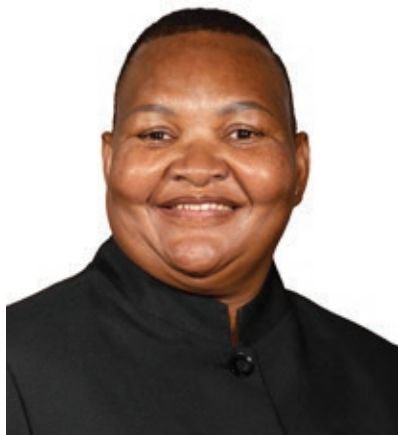
Dr P Boshielo (MP)

T here is no doubt that Policing has a profound impact on communities and plays a vital role in ensuring the safety and security of our nation. The assurance of safety and security is not merely a function of government; it is a foundational pillar upon which the stability and prosperity of our nation is built.