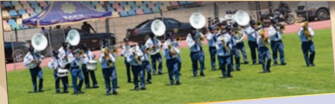
The South African Police Service Band was made up of members from different provinces that came together to play melodic music to celebrate the day.