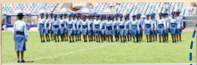
An all women in blue parade, showcasing the different drills.