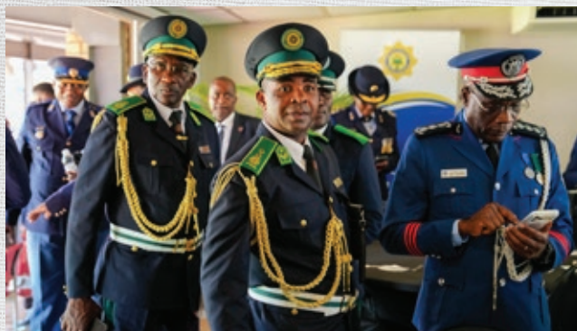
Arrival of invited Southern African Regional Police Chiefs and Director Generals at the Dr Rantlai Petrus Molemela Stadium.