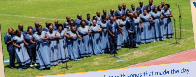
The SAPS Choir serenaded the attendees with songs that made the day fill up with joy.