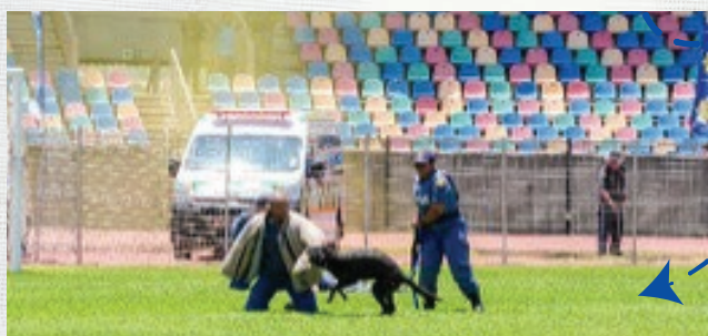
A simulation of police arresting a suspect with the assistance of a K9 dog.