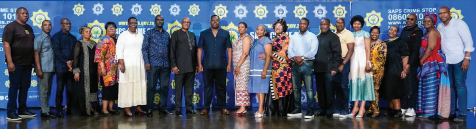
The SARPCCO Police Chiefs with the SAPS leadership at the send-off function in Bloemfontein.