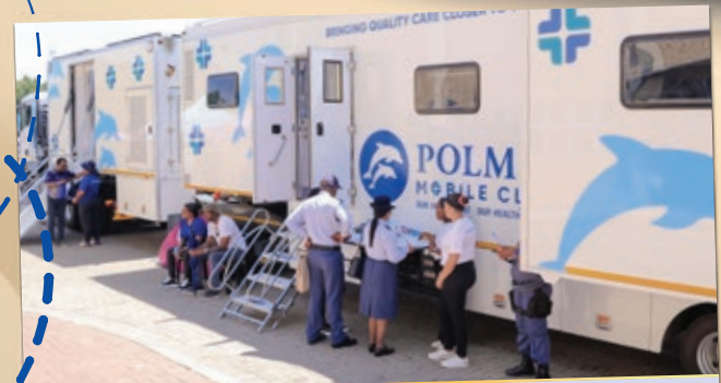
Recently launched, the POLMED Mobile Clinic was present to offer quality medical care to police officers and their family members in Bloemfontein.