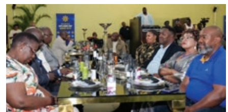
SARPPCO Police Chiefs with the SAPS top brass following proceedings at Imvelo Safari Lodge in Bloemfontein during the farewell function of retired Generals.