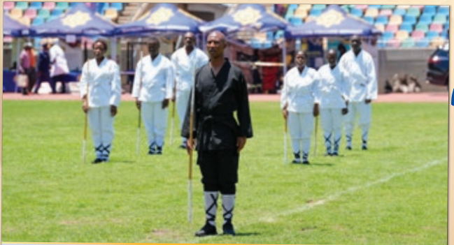
Police officers doing martial arts to display their fitness and readiness to fight crime at any given moment.