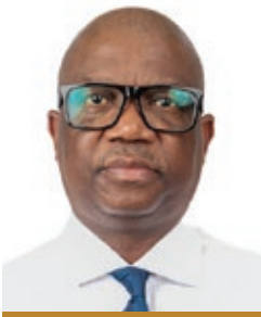
LED BY BRIGADIER WS KUNENE