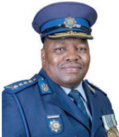
General SF Masemola (SOEG)

A s I traverse the length and breadth of our country in service of the people of South Africa, I am continually inspired by the calibre of men and women who serve within the South African Police Service (SAPS). Across all ranks and environments, I encounter members who exemplify hard work, dedication, professionalism, and competence. While I am privileged to personally acknowledge some of these outstanding individuals, it is inevitable that many others, equally deserving, may go unrecognised in the course of daily engagements.