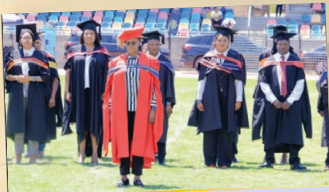
The SAPS graduates' parade in gowns to show and motivate learners that there are employees with qualifications within the organisation, and it is possible to reach greater heights in education with the assistance of a bursary that SAPS offers.