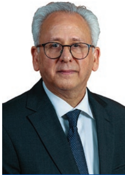
Prof F Cachalia

I t is a profound honour to support the 2026 South African Police Service (SAPS) National Excellence Awards.