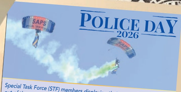
Special Task Force (STF) members displaying their prowess by jumping out of the aircraft to land safely in Dr Rantlai Petrus Stadium in Bloemfontein during celebrations of National Police Day.