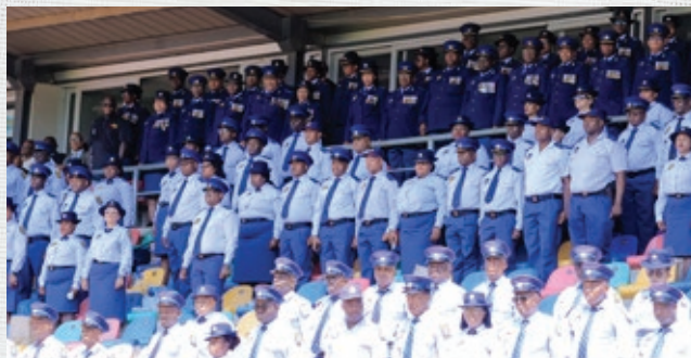
The SAPS from all nine provinces descended on Bloemfontein to commemorate National Police Day on 27 January 2026.