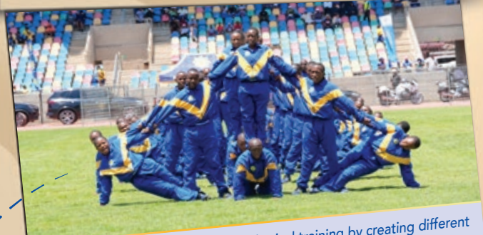
The aerobics team displaying their physical training by creating different shapes.