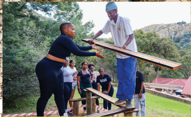
Collaborative activities were conducted to encourage team work and patience among beneficiaries.