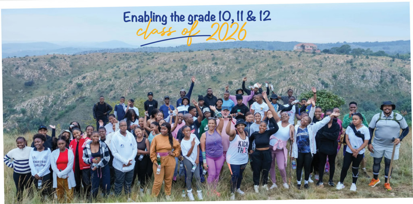
The 2026 SAPSET Leadership Camp participants on top of a hill during a hiking session in Krugersdorp.

T he 2026 instalment of the South African Police Service Education Trust (SAPSET) Leadership Camp took place from 29 March to 01 April 2026 at Achterberg Conference Centre, Krugersdorp, Gauteng. The camp, which is in its third year, saw 55 beneficiaries whose parents lost their lives in the line of duty exposed in sessions of leadership, discipline, resilience, dealing with loss, hope, personal growth and career road mapping.