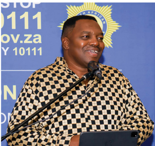
General Fannie Masemola addressing learners at the leadership camp held Achterberg Conference Centre in Krugersdorp, Gauteng.

The General also reassured them that if they take the opportunity with both hands, the world will be their oyster while SAPSET takes care of all their educational needs. "As the SAPS, we remain committed to supporting and nurturing young talent. Through SAPSET, we will continue to create platforms that empower young people to rise above their circumstances and realise their full potential. This is part of our broader commitment to building a safer, more inclusive, and more prosperous South Africa," affirmed General Masemola.